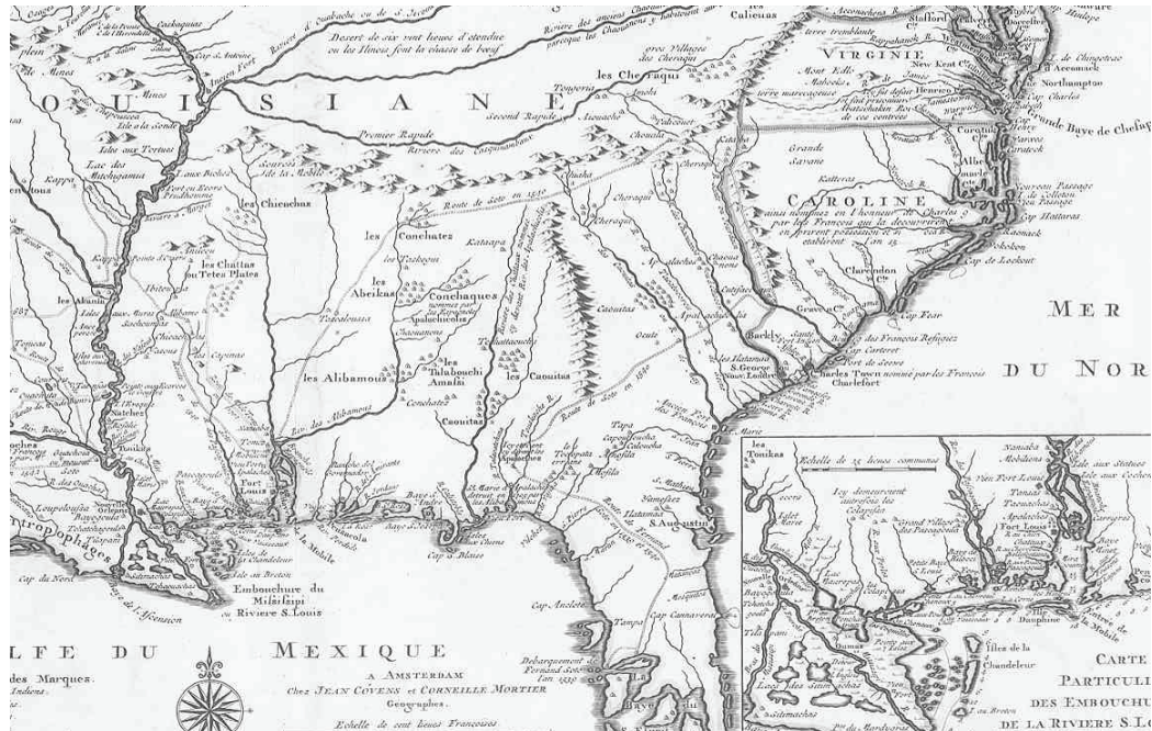
Figure 1. Detail from Guillaume Delisle's 1718 map, "Carte de la Louisiane et du cours du Mississippi."

Africans arrived in the sixteenth century, they landed not in a pristine world, but one profoundly shaped by Native actors for the past ten thousand years.