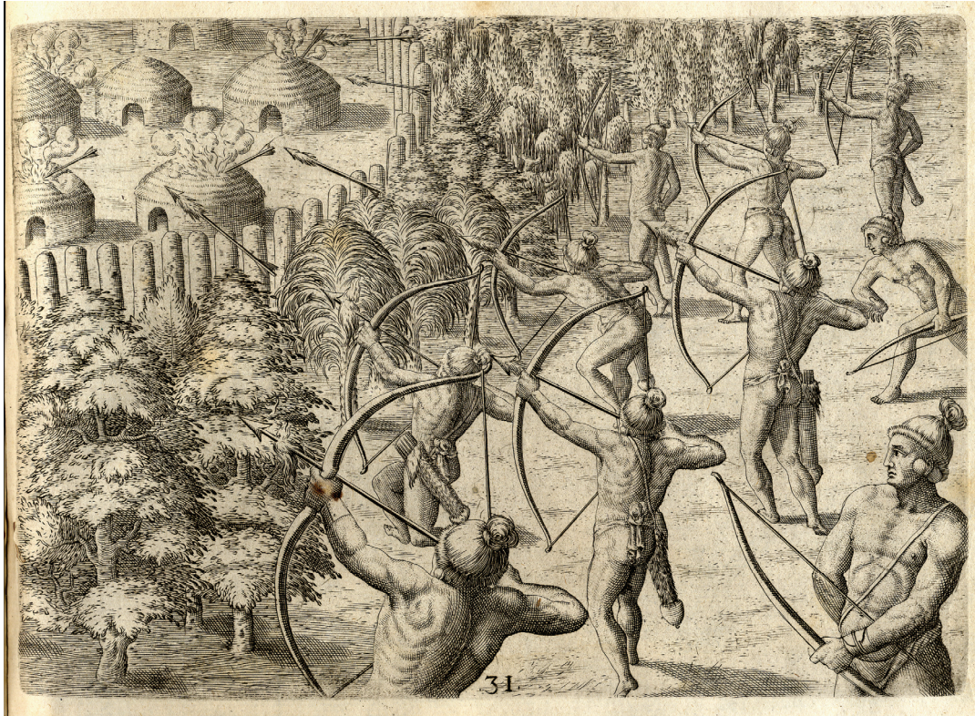
Figure 3. Native warriors shot fire-tipped arrows into enemy villages, igniting thatched roofs. Note the wooden palisade surrounding the village. Theodor de Bry engraving after an original drawing by Jacques LeMoyne de Morgues. Theodor de Bry, Brevis narratio eorum quae in Florida Americae provi[n]cia Gallis acciderunt, 1591, Vol. II, Plate 31.

Once enemies accepted defeat, they entered into a tributary relationship with the victorious chief, giving him a share of their resources. In 1560, warriors from the Coosa chiefdom set out against the recalcitrant Napochies. Twenty years earlier, the Soto entrada encountered the Coosa chiefdom at its height; over 200 miles long, the chiefdom stretched from Chiaha in eastern Tennessee to Talisi in central Alabama, controlling between seven and ten subordinate chiefdoms. Perhaps due to epidemic disease, Coosa's control over its subordinates had weakened, and some now refused to pay the chief tribute. The Napochies, who lived to the Northwest, had cut ties with their former overlords by killing a number of Coosas. When Major Sergeant Mateo del Sauz arrived in 1560 as part of the Tristan de Luna