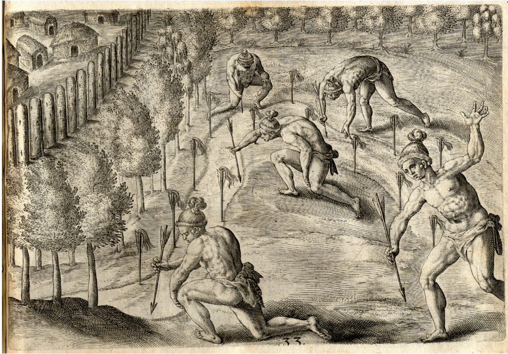
Figure 2. Warriors planting arrows topped with pieces of their own hair outside an enemy village. Despite de Bry's tendency to idealize masculine bodies, historical evidence confirms warriors' emphasis on wearing distinctive hairstyles and leaving their mark on war sites. 9 Theodor de Bry engraving after an original drawing by Jacques LeMoyne de Morgues. Theodor de Bry, Brevis narratio eorum quae in Florida Americae provi[n]cia Gallis acciderunt , 1591, Vol. II, Plate 33.

that realm. The human body is a remarkably adaptable canvas, and Native Southerners modified their appearances to reflect ethnic and political differences. 8