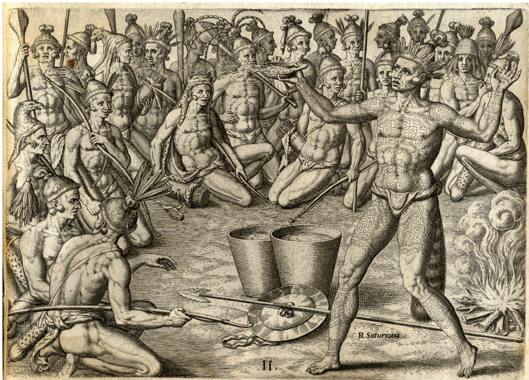
Figure 4. Chief Satouriona's ceremonial preparation for battle. Note the drops of water, signifying the blood of Satourina's enemies. This drawing also richly illustrates the costume of Mississippian warriors. Satourina's elaborate tattooing signifies his high rank. His feathered crown invokes his connection to the Upper World. Also note the war clubs and animal skins of other warriors. Theodor de Bry engraving after an original drawing by Jacques LeMoyne de Morgues. Theodor de Bry, Brevis narratio eorum quae in Florida Americae provi[n]cia Gallis acciderunt, 1591, Vol. II, Plate 11.

Displaying their spiritual power, chiefs used ritual to control warfare. In 1564, Frenchman Rene Laudonniere witnessed Chief Satouriona's preparations for war against his enemy, Chief Thimogona. Laudonniere reported that Satouriona walked down to the St. Johns River, where subordinate chiefs brought him water. "This being done, he looked up to heaven and began to discuss many things by gestures, showing a great heat in his emotions